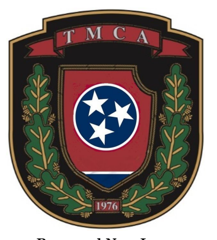
Proposed New Logo (yes, we know the stars are not aligned correctly yet.

Please email any opinions, thoughts or ideas to dhoagey@comcast.net.